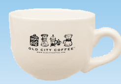
CL-101 24 oz. White (1 color, 1 side)

★ Prop 65 label may be required Direct Screen Charge: $45.00 (G) per color Imprint Area: 1 1/2" H x 4 3/4" W Case Pack: 24 Weight: 37 lbs.