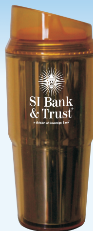
ASTL-611 14 oz. Acrylic Orange