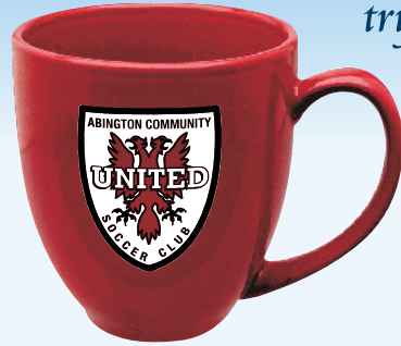
BC-110 16 oz. Burgundy

Direct Screen Charge: $45.00 (G) per color Imprint Area: 1 3/8"H x 2"W (Wrap 8 3/4") Case Pack: 36 Weight: 45 lbs.