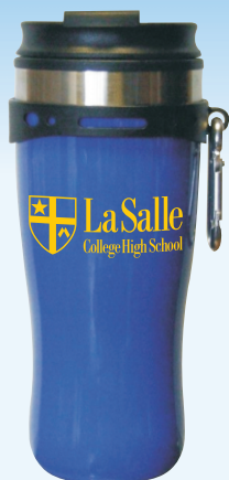
EDG-707 1/2 Litre w/ carabiner Blue (1 color, 1 side)