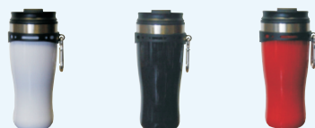
EDG-701 White EDG-703 Black EDG-791 Red