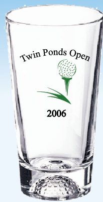
SMG-165 16 oz. Golf

★ Prop 65 label may be required Direct Screen Charge: $45.00 (G) per color Imprint Area: 3" H x 3" W Case Pack: 24 Weight: 32 lbs.