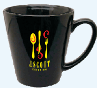
CMG-123 12 oz. Black

★ Prop 65 label may be required Direct Screen Charge: $45.00 (G) per color Imprint Area: 1 3/4" H x 2 1/4" W Case Pack: 36 Weight: 33 lbs.