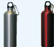
FR-101 Silver FR-191 Red

Reusable bottles are a great alternative to disposable containers