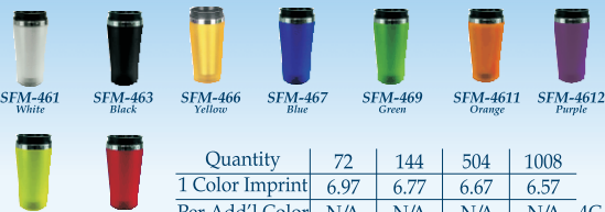
SFM-461 White SFM-463 Black SFM-466 Yellow SFM-467 Blue SFM-469 Green SFM-4611 Orange SFM-4612 Purple