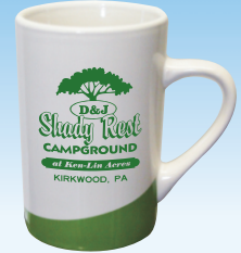
SLM-809 12 oz. Green

Direct Screen Charge: $45.00 (G) per color Imprint Area: 2 1/4"H x 2 3/4"W (Wrap 5 1/2") Case Pack: 36 Weight: 34lbs.