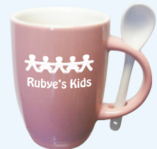
SPN-914 12 oz. Pink

Direct Screen Charge: $45.00 (G) per color Imprint Area: 2 3/8"H x 2 3/4"W (Wrap 7 3/4") Case Pack: 36 Weight: 31lbs.