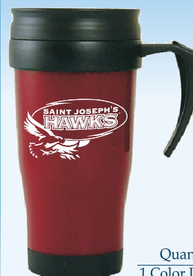
OTM-10 15 oz. Plastic Ontario Maroon