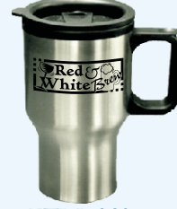
FTM-660 14 oz. Travel mug

Direct Screen Charge: $45.00 (G) Imprint Area: 2 1/4"H x 3 1/2"W Case Pack: 24 Weight: 21 lbs.