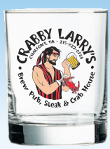
B-307 14 oz. Double Old Fashion

★ Prop 65 label may be required Direct Screen Charge: $45.00 (G) per color Imprint Area: 2 1/2" H x 3" W Case Pack: 36 Weight: 28 lbs.