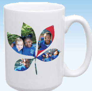
DSEG-221 15 oz. White