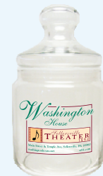
GJ-24 24 oz. Apothecary