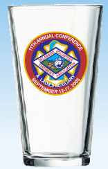
MG-16 16 oz.