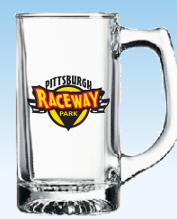
B-116 13 oz. Sport

★ Prop 65 label may be required Direct Screen Charge: $45.00 (G) per color Imprint Area: 3 1/2" H x 2 3/4" W (Wrap 6 5/8") Case Pack: 24 Weight: 33 lbs.