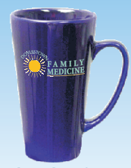
CMG-167 16 oz. Cobalt

★ Prop 65 label may be required Direct Screen Charge: $45.00 (G) per color Imprint Area: 2 3/4" H x 2 1/2" W Case Pack: 24 Weight: 32 lbs.