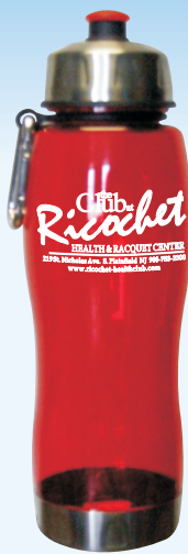
ALP-391 28 oz. Sport w/ carabiner Red