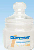
GJ-16 16 oz. Apothecary