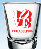
W-954 1 ½ oz. Tapered