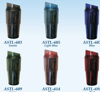
ASTL-603 Smoke ASTL-605 Light Blue ASTL-607 Blue ASTL-609 Green ASTL-614 Pink ASTL-691 Red