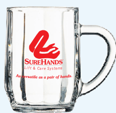
D-619 10 oz. Distinction Hayworth

★ Prop 65 label may be required Direct Screen Charge: $45.00 (G) per color Imprint Area: 2 3/4" H x 2 1/4" W Case Pack: 36 Weight: 32 lbs.