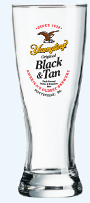
BP-16 16 oz. Grand

★ Prop 65 label may be required Direct Screen Charge: $45.00 (G) per color Imprint Area: 2 1/2" H x 2 3/4" W Case Pack: 12 Weight: 15 lbs.