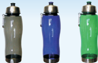
ALP-303 Smoke ALP-307 Blue ALP-309 Green