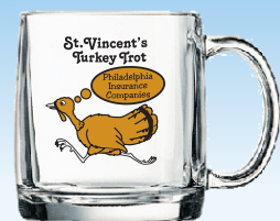
B-501 13 oz. Nordic

★ Prop 65 label may be required Direct Screen Charge: $45.00 (G) per color Imprint Area: 2 1/4" H x 2 3/4" W Case Pack: 24 Weight: 24 lbs.