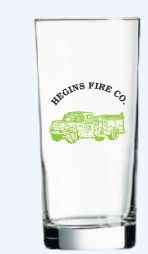
B-303 13 oz. Glass

★ Prop 65 label may be required Direct Screen Charge: $45.00 (G) per color Imprint Area: 4" H x 2 1/4" W (Wrap 8 3/4") Case Pack: 36 Weight: 23 lbs.